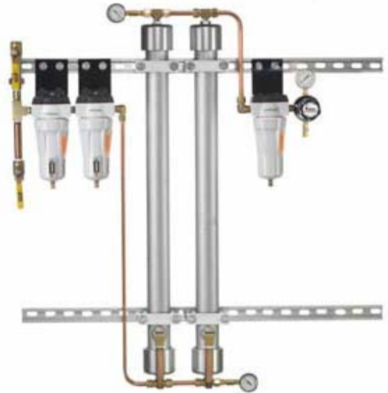
Pictured is the M1-168 Nitrogen Generator

Integra Services stocks maintenance kits for M1 nitrogen Generators.